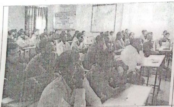
Students in Guest Lecture