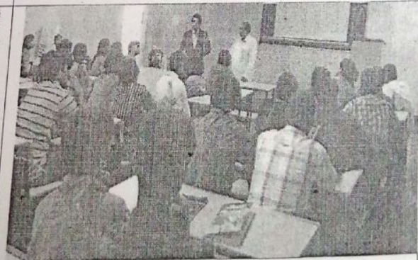
VOTE OF THANKS BY THE HOD