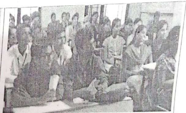
Students of NNRG