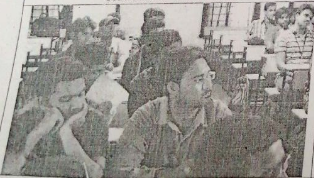
Students in Guest Lecture